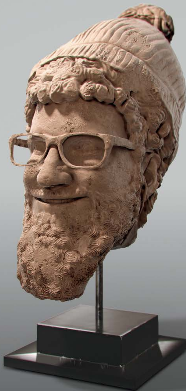
Italian Hipster smiles at Athens International Airport Ceramic, 2019 A.D.